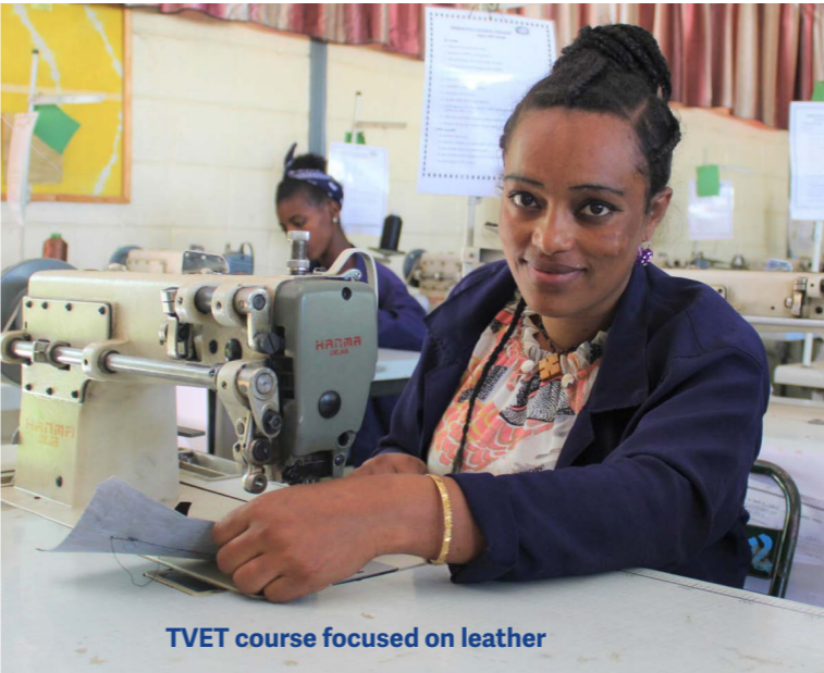
TVET course focused on leather