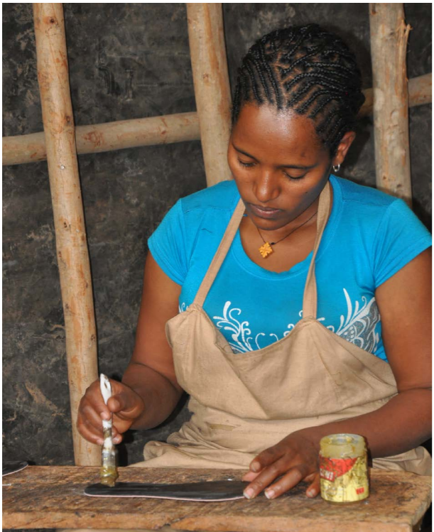
Students attending TVET courses

difficult for women, who cannot find decent work opportunities and are most often concentrated in the informal sector. In recent decades, economic factors have been the most common drivers of migration from Ethiopia, followed by political reasons including insecurity, and ethnic tensions. Migration is increasingly perceived as the only way out of poverty in Ethiopia, especially for the rural youth. The TVET sector was sought to provide skills training for youth and equip them with adequate technical skills to enable them compete & access employment in the government and private sector. However, the TVETs have barriers in the effectiveness of their vocational training programmes, some of which might be listed below: • Poor quality and relevance of the vocational training & lack of career counselling and coaching services within the TVET system; • Lack of skilled trainers with industry connections and experience; • Lack of opportunities for work-based learning and internships; • Lack of effective platforms for dialogue between employers/private sector and education institutions.